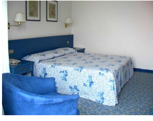
<u>Location:</u> STRESA 600 mt to the Palazzo dei Congressi

Spaces, comfort, customer care: services at the Hotel Lido offer everybody the chance of enjoying one's time in the most pleasant way.